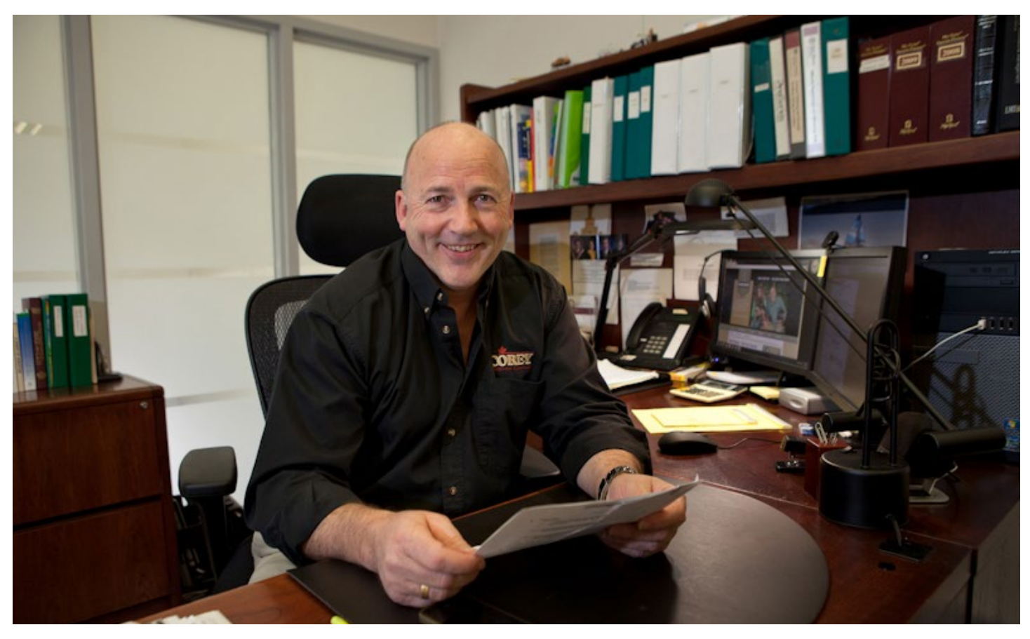
For over 35 years, Corey Nutrition has remained family-owned and operated in New Brunswick with nutritional integrity at its core.